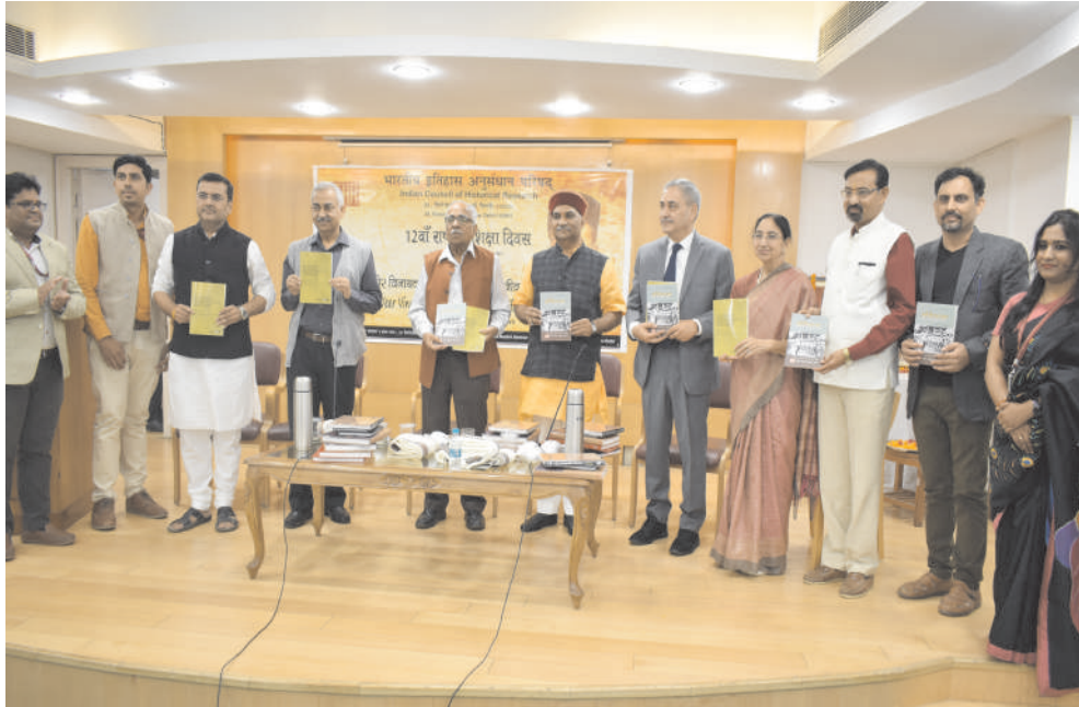
Distinguished speakers, Chairman & Member Secretary and ICHR officers during 12 th National Education Day, on 'Veer Vinayak Damodar Savarkar : Life and Mission'.