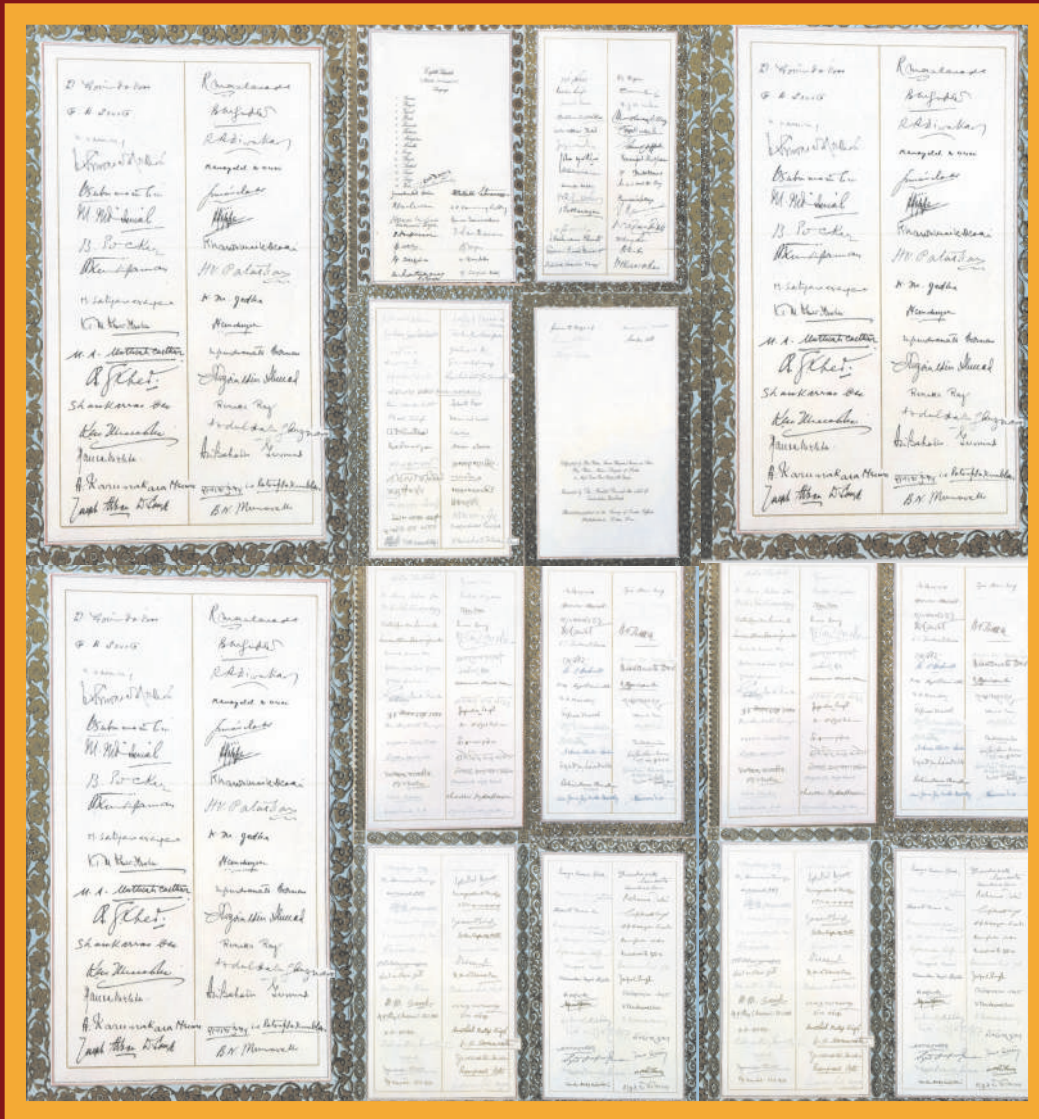
8th Schedule : Original Calligraphed and Illuminated Signatures of the Members of Constituent Assembly