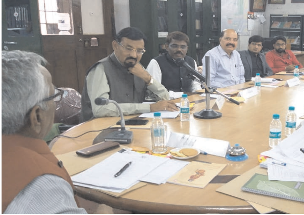
Monitoring/Advisory Committee Meeting of the Southern Regional Centre, Bengaluru.