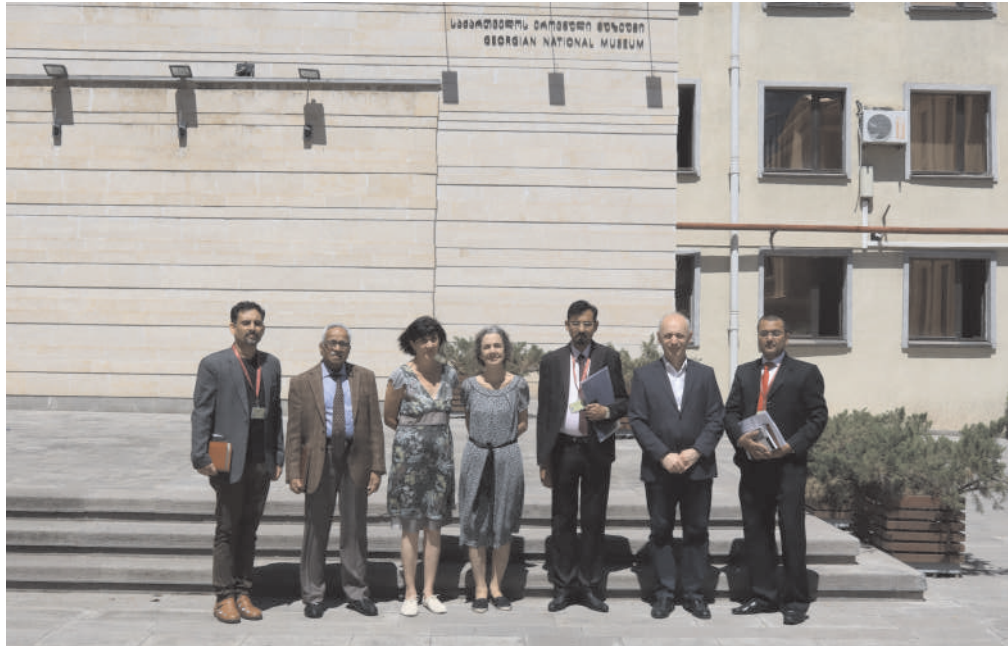
ICHR Delegation and Officers of Georgian National Museum during the visit of National Museum, Tbilisi.