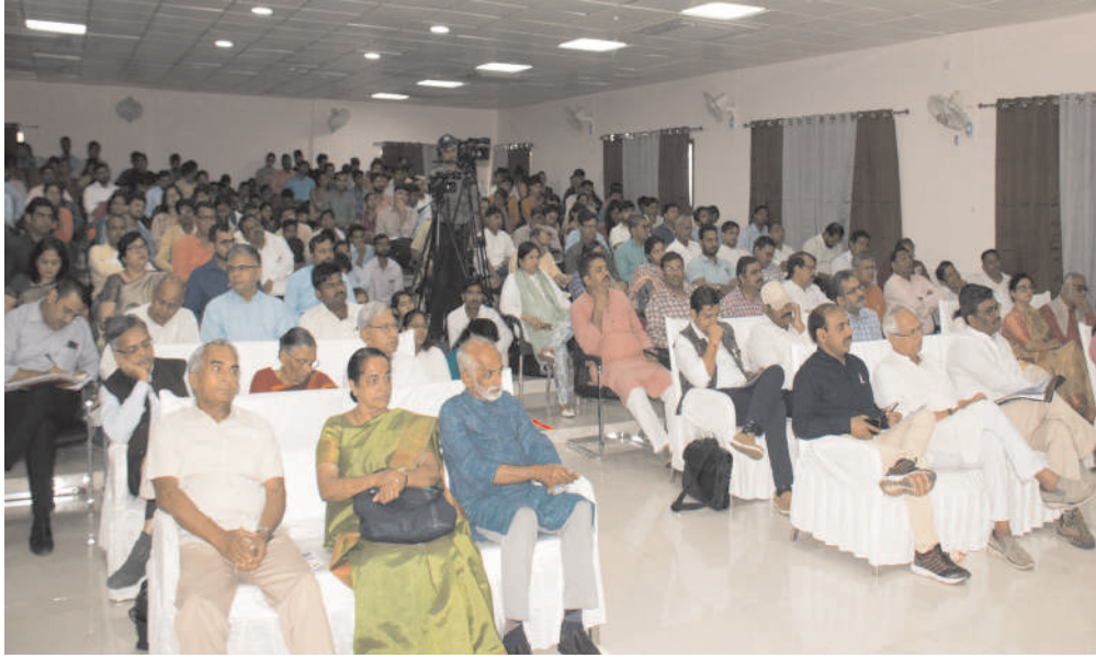
Distinguished delegates and audience during the ICHR organised National Seminar on 'गांधी और उनकी समसमयिक प्रासंगिकता : समाज, संस्कृति और स्वराज' : at Mahatma Gandhi International Hindi University, Wardha.