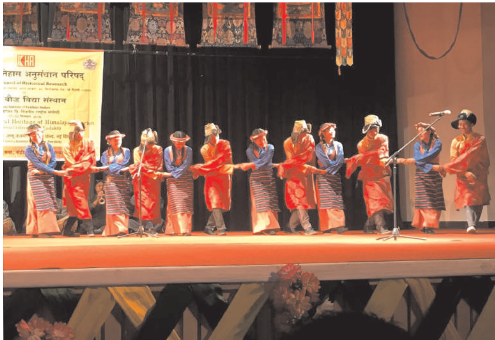
The Artists had Performed Ladakh's Traditional Folk Dance : A Cultural evening during the seminar, 'History and Cultural Heritage of Ladakh' at Leh.